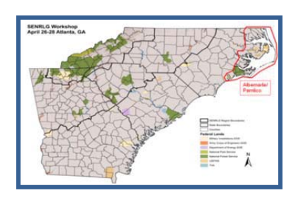
Figure 13.3. Albemarle-Pamlico Estuary.

The project is being directed through the Southeast Natural Resource Leaders Group (SENRLG) (U.S. EPA 2011b). SENRLG is comprised of regional Federal agency leaders across the SE with natural resource mission responsibilities (Figure 13.2). The SENRLG Landscape Conservation and